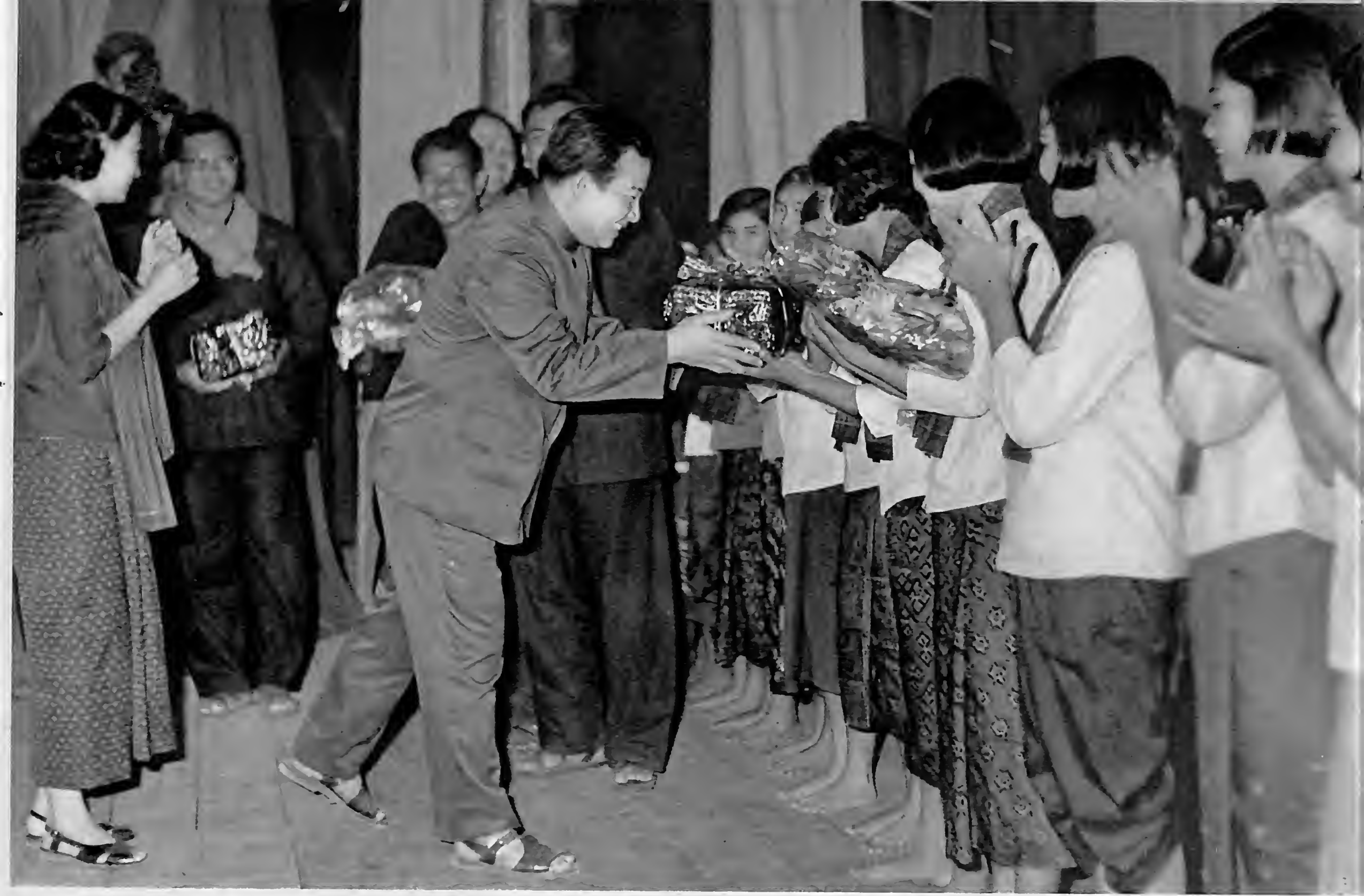
After the show, Samdech and Madame Sihanouk mount the stage to congratulate the artists.